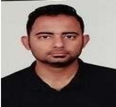
Samples of photographs which are not acceptable